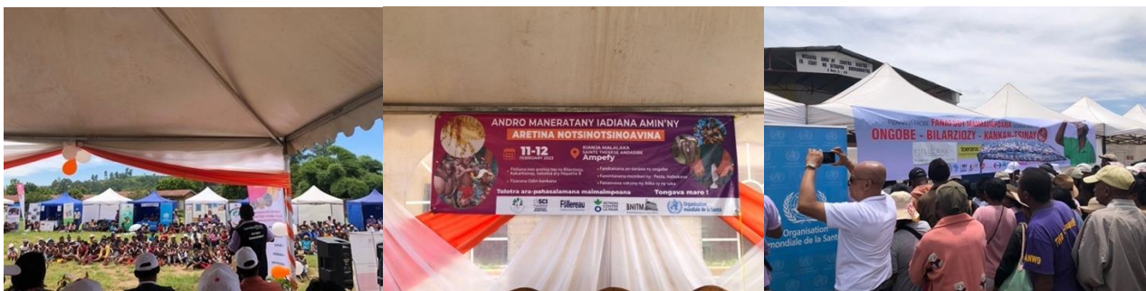
First Malagasy NTD day celebrations in Ampefy (11 February 2023). On the left: spectators waiting for the puppet show to begin. On the right: queue for free screening and treatment for NTDs

https://www.ncbi.nlm.nih.gov/pmc/articles/PMC10432657/pdf/bmjgh-2023-012598.pdf