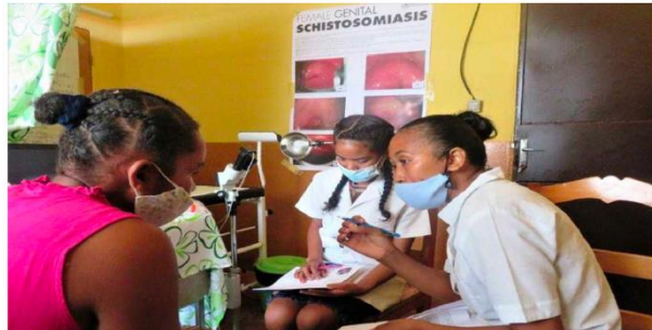
Picture 1. Impressions from colposcopy training in Madagascar.

The World Health Organisation (WHO) calls for scaling up screening, improving the HPV vaccination coverage and enhancing affordable treatment access, leading to HPV related cervical cancer elimination by 2100. Despite the introduction of HPV vaccinations in 2006, the impending shortage of doses raises concerns about equitable access.